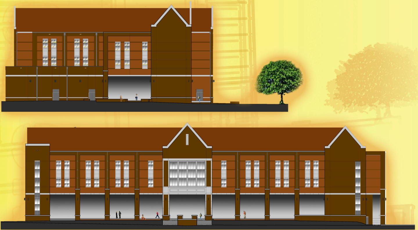
New Classroom Building